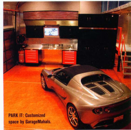
PARK IT: Customized space by GarageMahals.